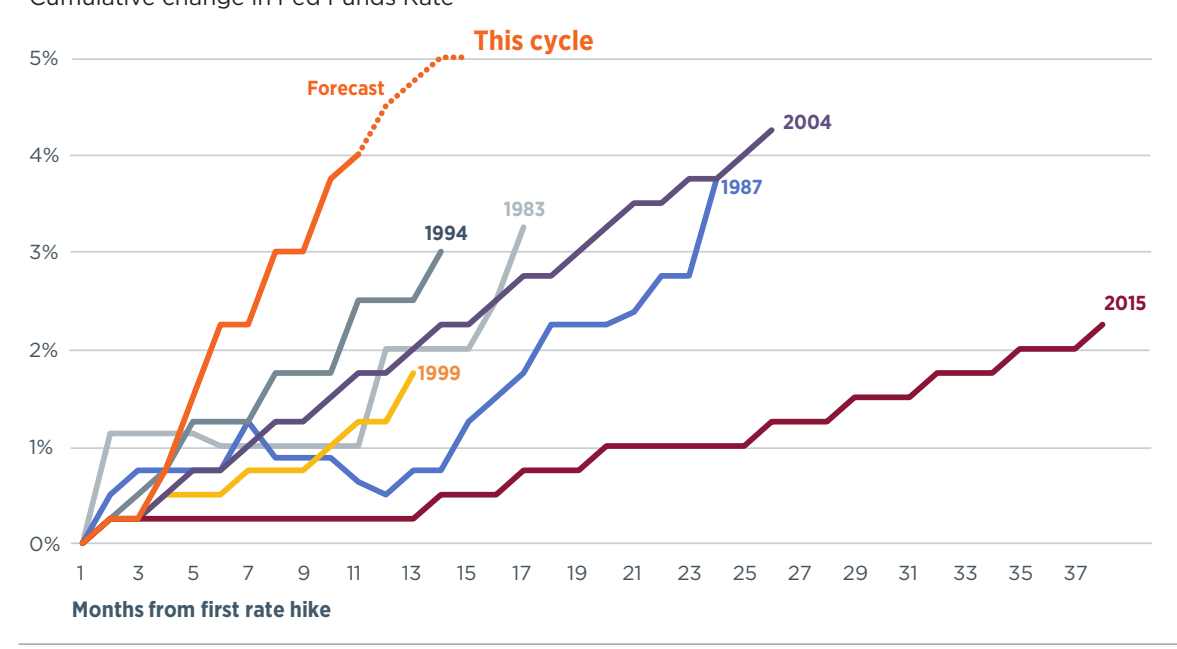
Figure 2 The Fed has embarked on the most aggressive rate-hike cycle in history Cumulative change in Fed Funds Rate